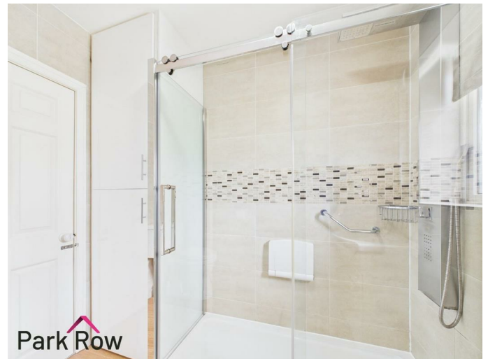
An obscure double glazed window to the rear elevation and includes a white suite comprising; a close coupled w/c, a hand basin with chrome taps over set within a white wooden unit with space for storage, a walk in waterfall shower with a glass shower screen, a chrome heated towel radiator, a door which leads into a storage cupboard and is fully tiled floor to ceiling.