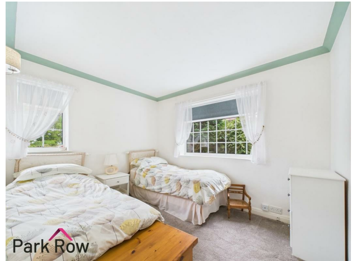
Double glazed windows to the rear and side elevation, a central heating radiator and a built in white wooden storage cupboard.