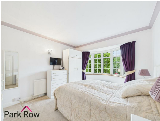
A double glazed bay-window to the front elevation, a central heating radiator and built in white wooden storage cupboards.